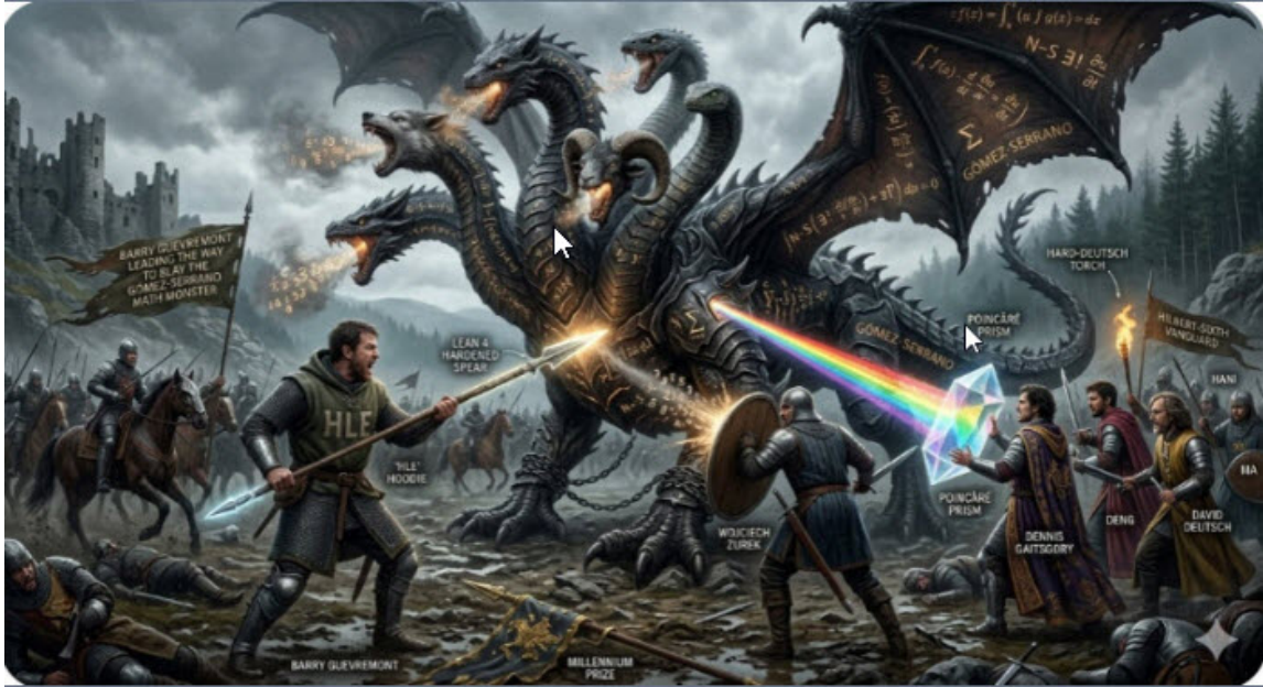
Figure 1: The Math Monster That Never Existed